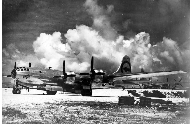
While I do not condone the bombing and related killing of innocent humans, as there is no morality in warfare, I must bring into view

29 Superfortress Bomber that was chosen to drop the world's first atomic bomb on Hiroshima, Japan on August 6<sup>th</sup>, 1945. The crew of the Enola Gay could only guess what the mission might be, but were not told what the weapon in its bomb bay was. Special Mission No. 13 would drop the first "gadget" (military name for the bomb) as ordered in their Mission.